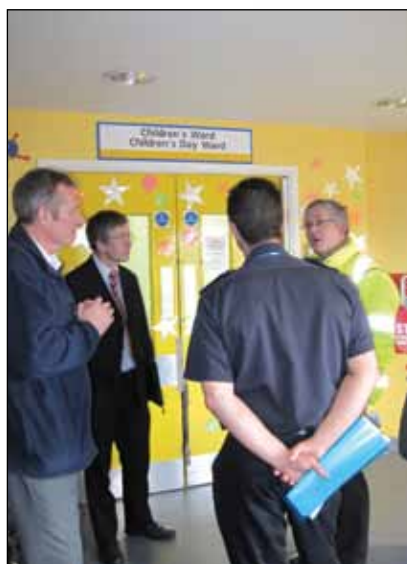
The Island's Fire Enforcement Officer & Building Control were involved in the work as it progressed