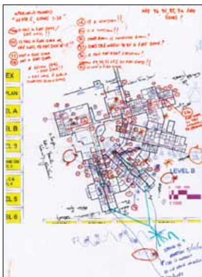
Existing drawings found to be not fit for purpose